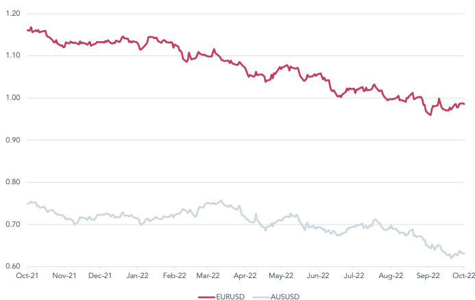
FIGURE 4: EURO AND AUSTRALIAN DOLLAR VS US DOLLAR

Past performance is not a guide to future performance.