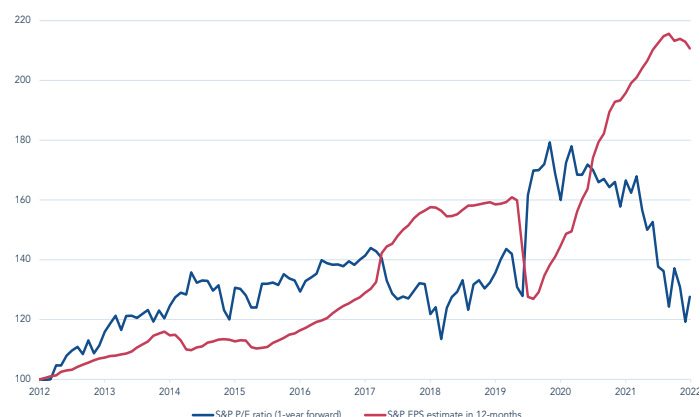
FIGURE 7: S&P 500 INDEX FORWARD EPS AND PE RATIO*

Neither past nor projected results are indicative of future results.