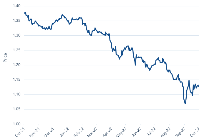
FIGURE 2: STERLING VS US DOLLAR

Past performance is not a guide to future performance.