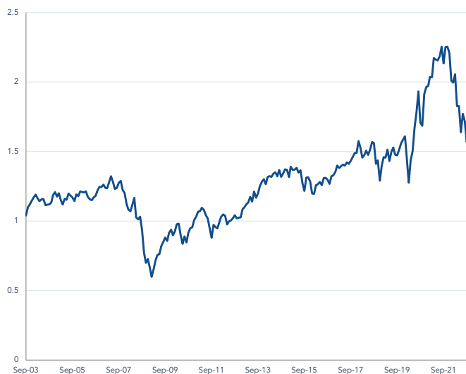
FIGURE 6: US MARKET CAPITALISATION/GDP

Past performance is not a guide to future performance.