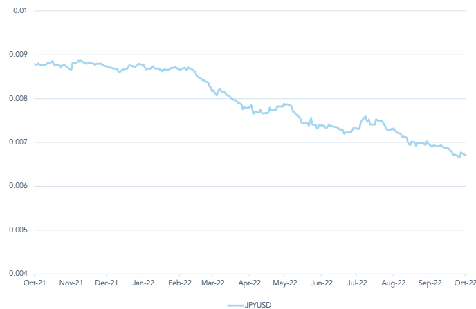
FIGURE 5: YEN VS US DOLLAR

Past performance is not a guide to future performance.